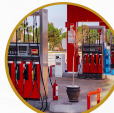
Special Purpose Properties